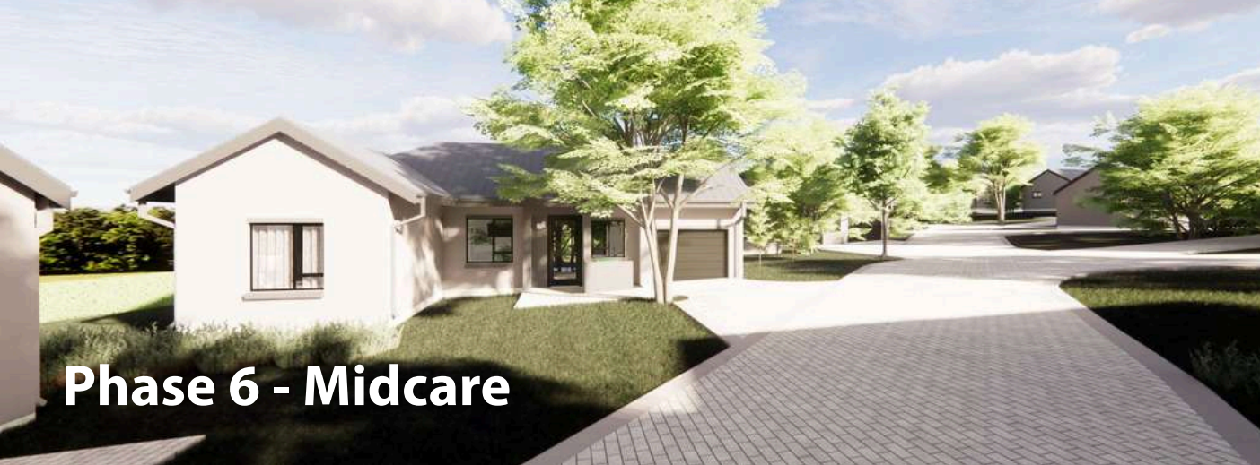
Phase 6 - Midcare